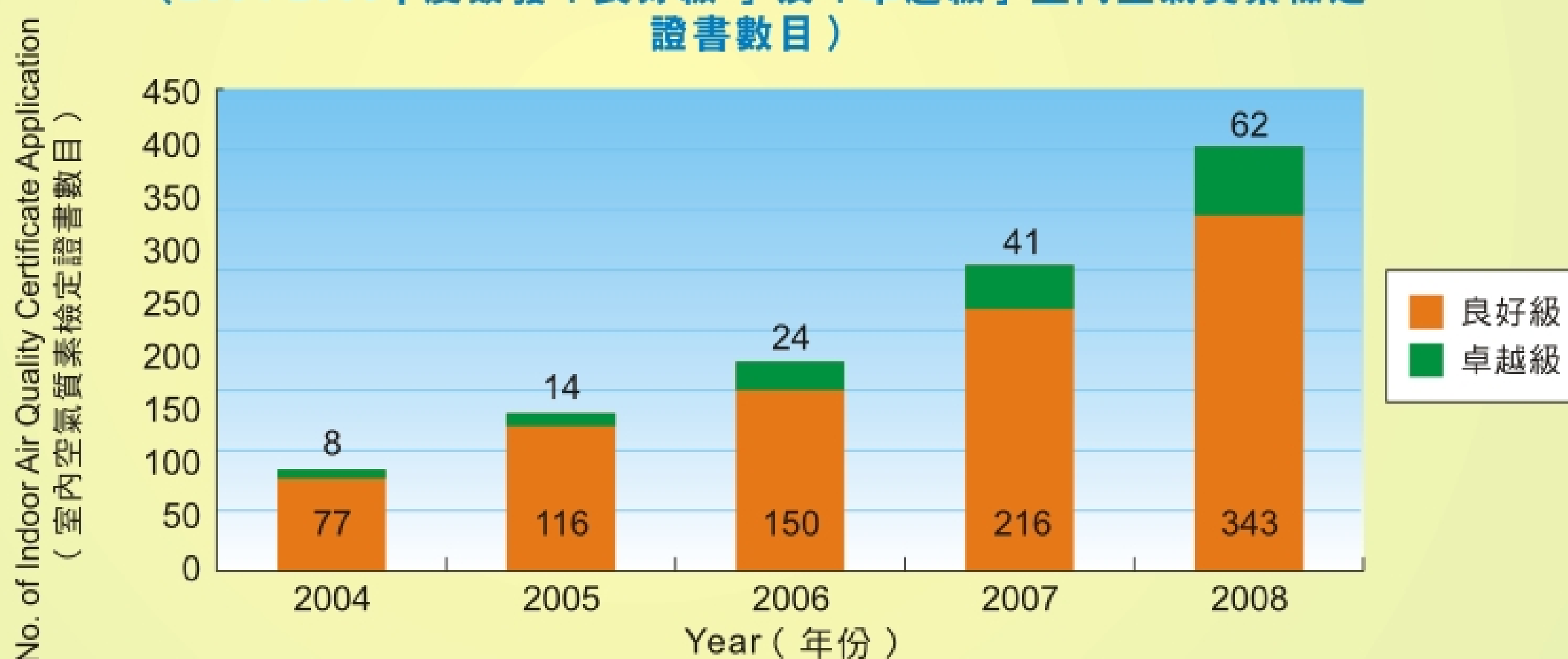
No. of application of certificate of different types of premises in 2008